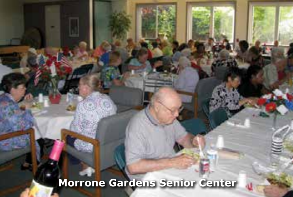
Morrone Gardens Senior Center