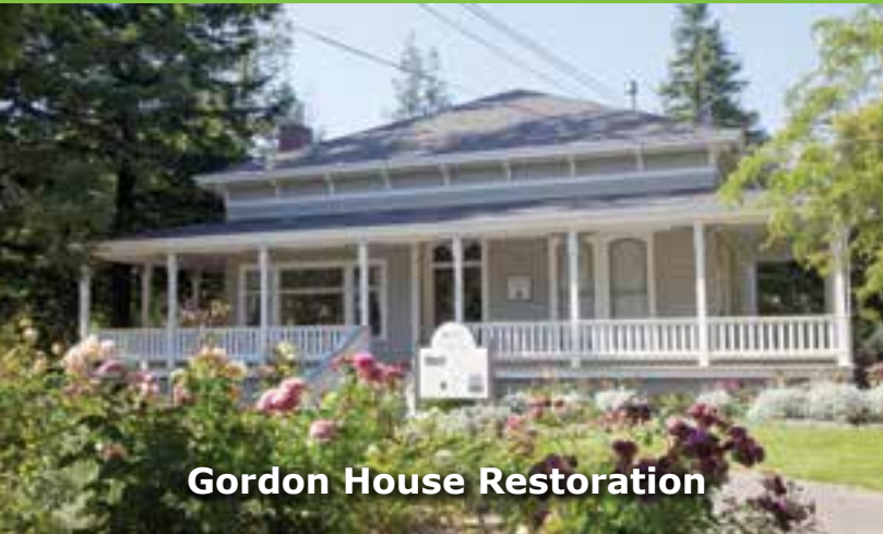
Gordon House Restoration