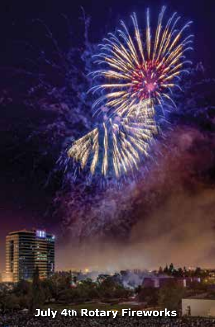
July 4th Rotary Fireworks