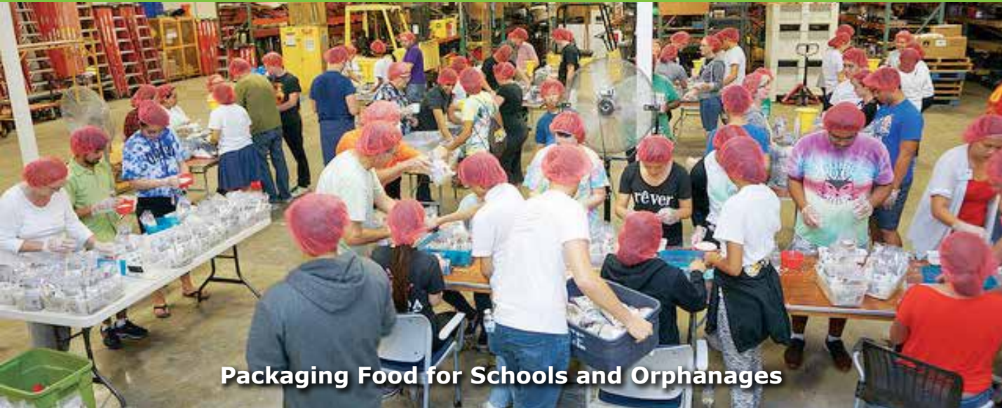
Packaging Food for Schools and Orphanages