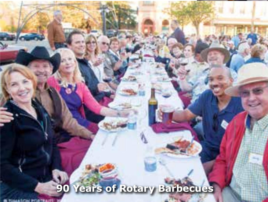
90 Years of Rotary Barbecues