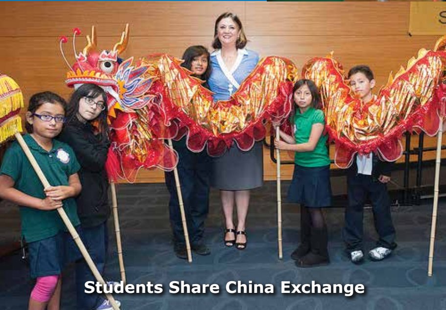
Students Share China Exchange