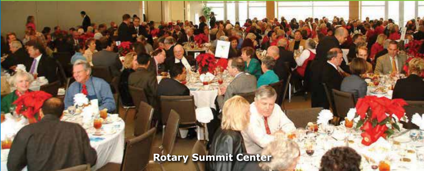
Rotary Summit Center