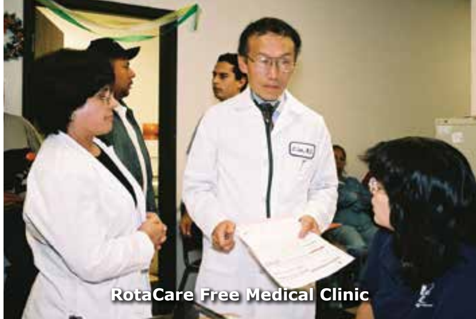
RotaCare Free Medical Clinic

The RotaCare clinic at Washington School provides free medical care for those without medical coverage. The Rotary Club of San Jose has deep roots in the community and takes action wherever and whenever a need arises.