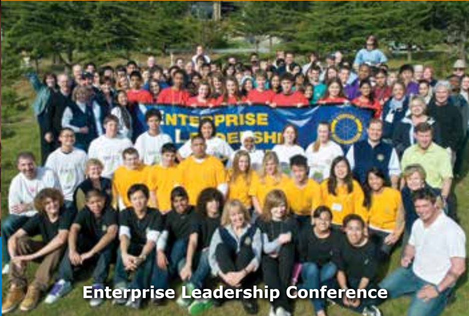
Enterprise Leadership Conference

Inspired by Service Fulfilled by Friendships