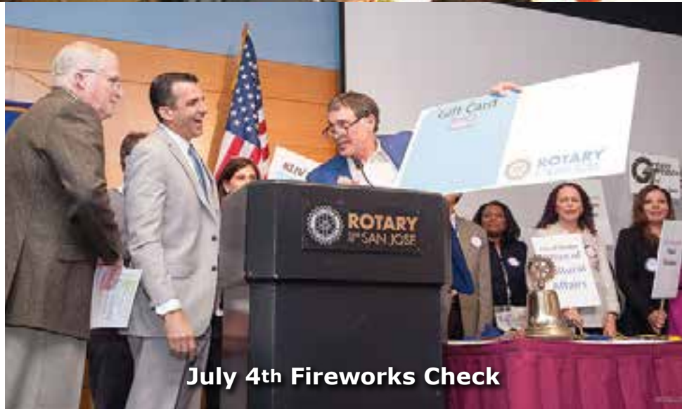
July 4th Fireworks Check

It is our shared values of service and our friendship bonds that result in the Rotary Club of San Jose getting so much done in this community – and beyond.