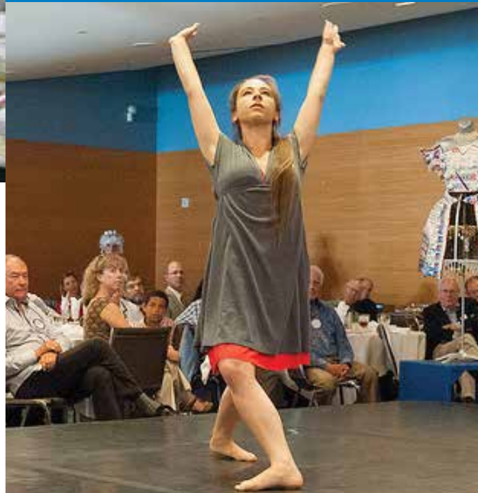
Leigh Weimers Emerging Artist Awards