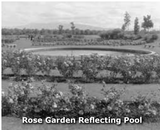
Rose Garden Reflecting Pool