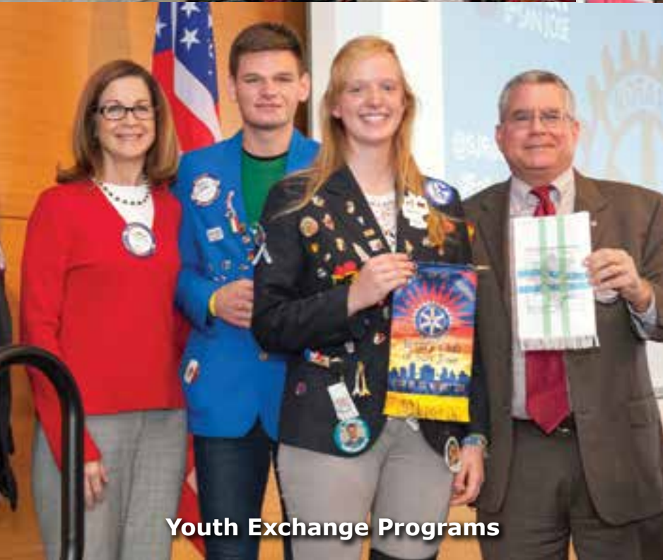
Youth Exchange Programs