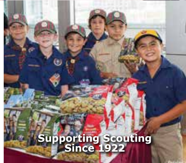
Supporting Scouting Since 1922

Students in San Jose are the beneficiaries of many Rotary programs. Inner city third graders go fishing, fourth graders go on field trips, fifth graders get scholarships to science camp. Seventh and eighth graders visit The Tech. Students participate in service clubs sponsored at five different high schools. High school juniors attend our three day Enterprise Leadership Conference and scouts of all ages participate in several groups chartered by the Rotary Club of San Jose. At Washington Elementary School, San Jose Rotarians support the students, staff and families with clubs, scholarships, College Night and even a student exchange to China.