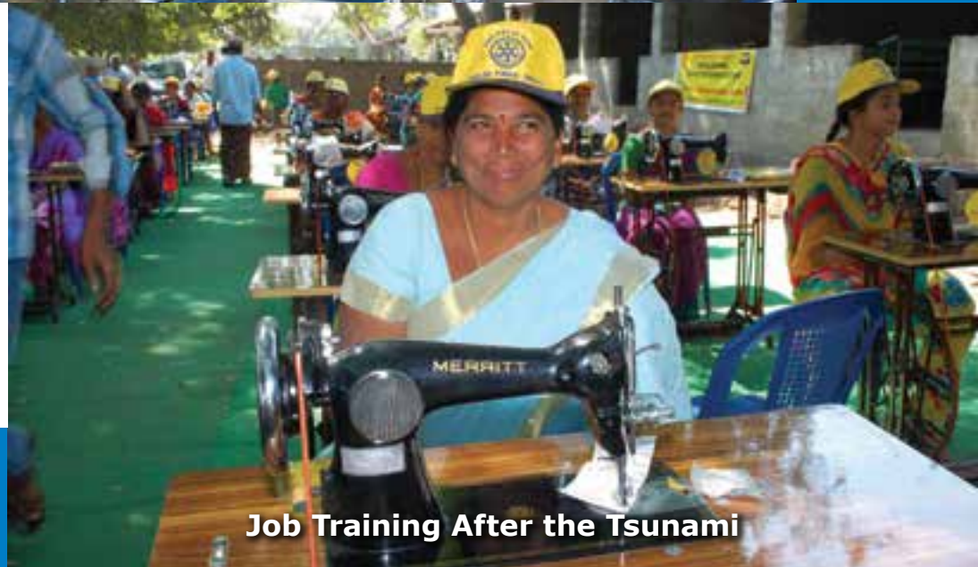
Job Training After the Tsunami

Since 1985, Rotary International has led the effort to eradicate polio in the world. The number of cases has fallen from 350,000 in 1985 to under 100 in 2015. Rotary, and our partners, are very close to eliminating this crippling disease.