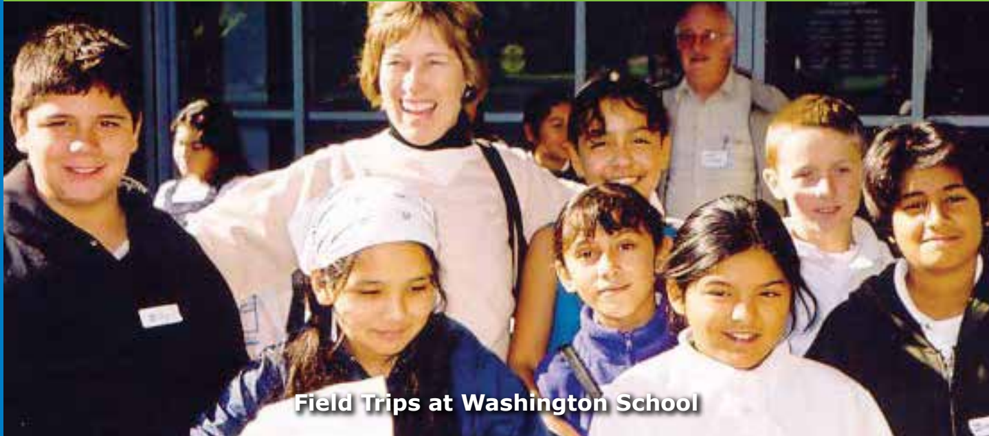
Field Trips at Washington School